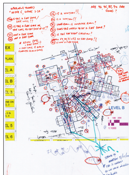
Existing drawings found to be not fit for purpose